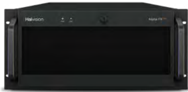
Alpha FX Elite

Command 360 software is integrated with a full range of Alpha FX video processors to meet your specific requirements – from multi-site deployments to single-site operations centers to conference rooms. We also offer our Stryke processors for rugged and ultra-rugged environments, such as emergency operations and frontline missions.