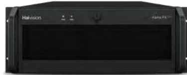
Alpha FX Core